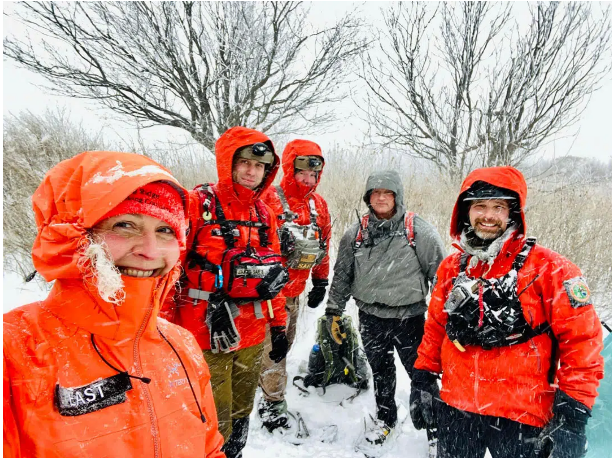
Photo of some of the rescue personnel who found the missing hiker.

Thanks to the trained officials of Haywood County Search & Rescue, the man was found safely without any injuries. As severe weather can quickly become a larger threat, especially this time of year, the organization urges the public to always remember to check the weather forecast and trail conditions before heading into the wild.